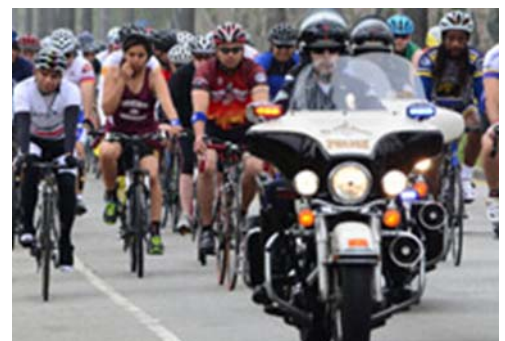
Right: The 2013 Volkswagen City of Angels Fun Ride